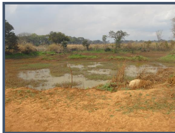
Picture: 1&2. The flooded part of Mpongwe-Machiya road at Ndubeni. The side of road was in August still flooded from the rainy season

Another feeder road that was on the priority list of roads to be rehabilitated from this project is the Mpongwe-Chowa road. The state of this primary feeder road continues to worsen with increased traffic by heavy trucks belonging to companies such as Roan Antelope Milling carrying maize grain. Fortunately, Roan Antelope Milling is willing to help in rehabilitating the road once equipment is available. During monitoring, it was found that there were some efforts by Roan Antelope Milling to put stones in some parts of the road that were in very bad state of disrepair. The local council also warned that if the first 4km of the