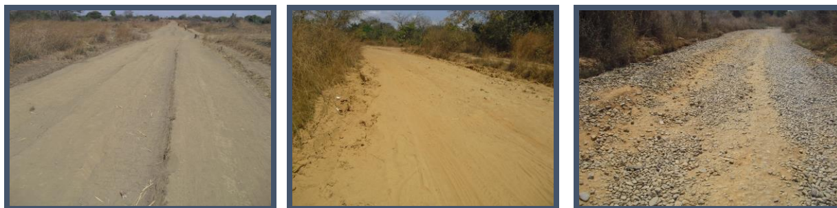
Picture: 3, 4 & 5. Some bad areas of the road and the stones put on parts of the road to alleviate the situation

road is not worked on, Lukanga resettlement will be cut off especially with the coming of the 2010-2011 rainy season.