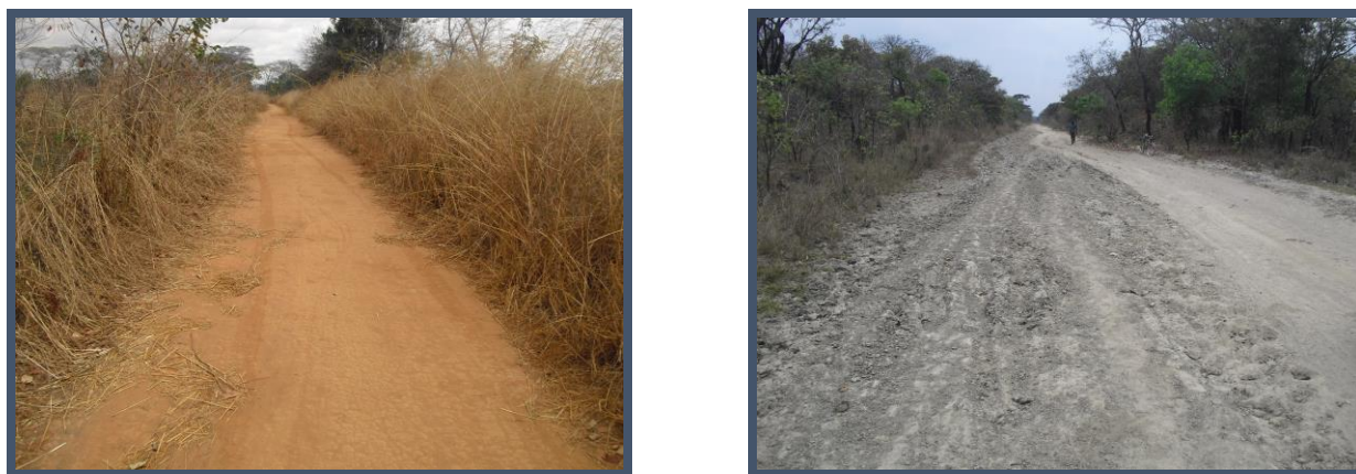
Picture 6 & 7: The narrow (left) and impassable parts in rainy season of Mulela-St. Anthony road

Other feeder roads in bad shape include Mulela - St. Anthony and Mpongwe-Shingwa while Mukumpu - Mukubwe and St. Anthony-Ndubeni are in fairly good state after being worked on in 2008 by the Rural Road Unit.