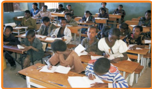
Education - Primary and Secondary Schools.

Government needs money to finance its development agenda. In Zambia, money is needed for services like education, roads, health care, national security, and social welfare. Therefore you have to pay your money to keep the Government running.