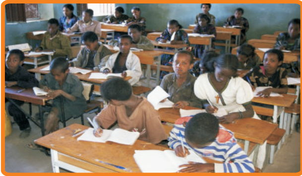
Education - Primary and Secondary Schools.

Government needs money to finance its development agenda. In Zambia, money is needed for services like education, roads, health care, national security, and social welfare. Therefore you have to pay your money to keep the Government running.