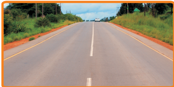
Roads - Local and International Routes

Your tax contribution helps to build a better Zambia and the more people pay their fair share, the less tax burden each individual has to bear.