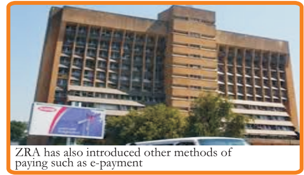
ZRA has also introduced other methods of paying such as e-payment

You pay tax to Government through Zambia Revenue Authority (ZRA). ZRA is a Government agency mandated to determine and collect taxes on behalf of Government. Its head office is based in Lusaka but has offices through which you can pay in a number of other towns.