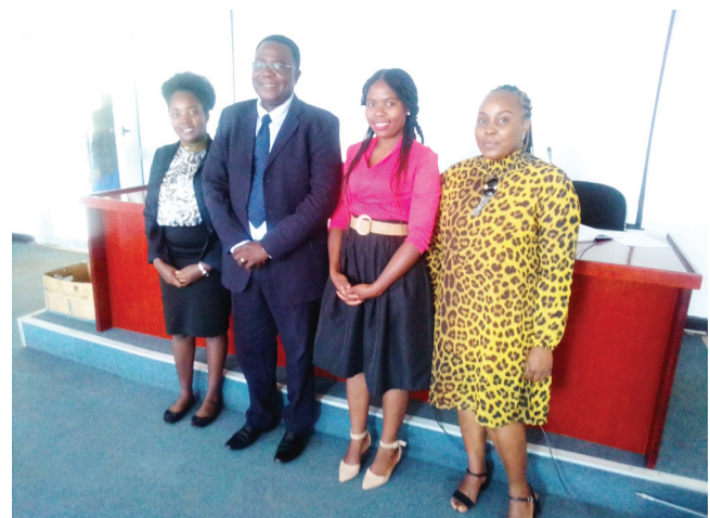
We continue to engage with Parliament through Parliamentary submissions on various topics