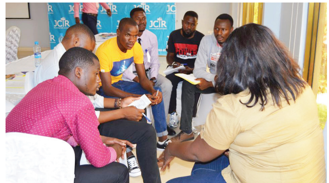
Participants at work during the JCTR held Youth Symposium on Debt and its effects on future generations