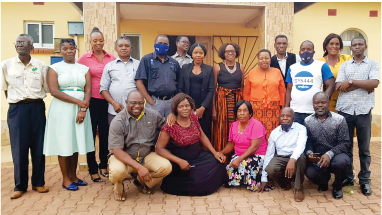
JCTR BNNB Data collectors pause for a photo during the 2020 BNNB data collection review meeting