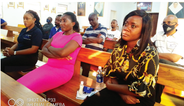
JCTR staff attending Mass during a staff retreat