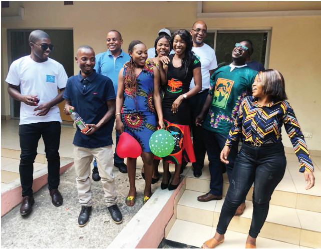
Happy Independence Mother Zambia