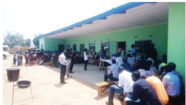
Fully operational Mwapona Clinic in Choma thanks to JCTR social audits