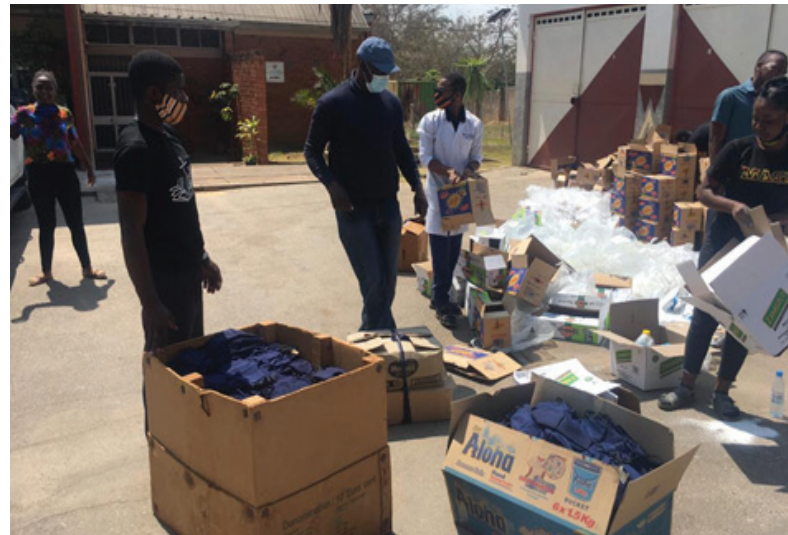
ZAM COVID-19 Collaborating with Magis and Jesuit Novices in Packing Food Hampers and face masks earmarked for distribution to vulnerable and high risky Communities

A theological reflection on this rupture is that like the plague that in the days of Moses took the lives of the first-borns of the Egyptians, so also a pestilence or pandemic of such immense proportions as COVID-19 demands an exodus, a movement away from our comfort zone, a shift in focus, a heightened consciousness, a new direction. We have to ask ourselves what God is saying to us and to Zambia in this situation and these circumstances. Hopefully, as a nation, we will do better than we did before COVID-19. Hopefully, we will respond with courage and not fear to this pandemic. Together and in unity we shall surmount all the problems of this dark moment of our history and time.