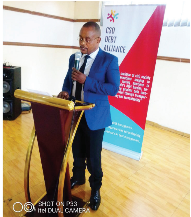
JCTR ED, launched the CSO debt alliance on 30th November 2020. The Alliance seeks to improve public debt management in Zambia