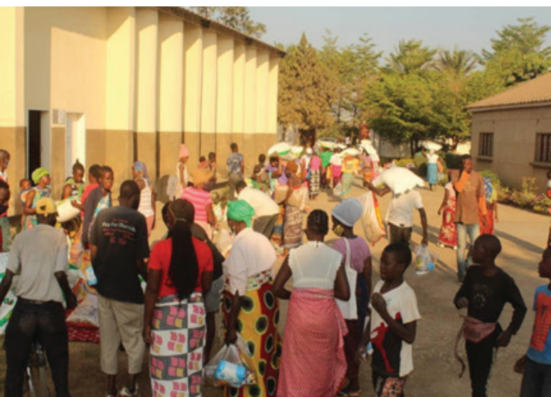
Women and child headed households bear the full brunt of the COVID-19 Socio-economic Crisis

At the domestic level, economic and agricultural opportunities must be explored to promote household resilience against poverty, while at the national level Zambia needs a reorientation in its policy direction. For example, we can afford to close Parliament for several weeks, even months if necessary (as is the case at present), but we can never afford to