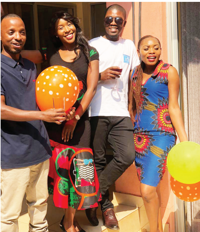
@56 we look forward to improved livelihoods for all Zambians!