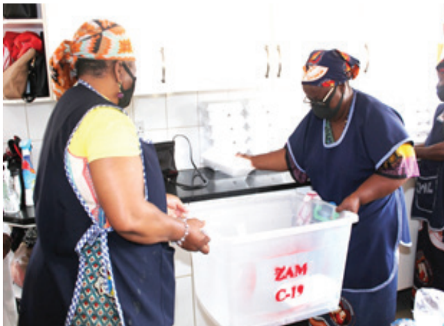
Catholic Women's League (CWL) Partnering with ZAM COVID-19 Task Force in a Feeding Programme for Front liners

abilities. COVID-19 containment and mitigation measures are certainly of the utmost importance, but they are not enough. We have to plan for the future of the country beyond COVID-19. This will entail making significant adjustments at the domestic and national levels, in the critical areas of innovation, production, consumption and general adaptation. Failing this, we will be courting chaos in the future. In a word, therefore, COVID-19 has reshaped our world and its future in an almost inconceivable way. Since, as human beings, we are self-reflecting creatures, one thing is clear: the new normal is here to