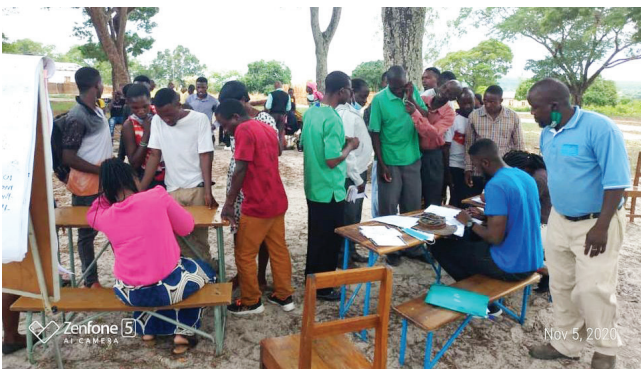
JCTR supporting Chavuma Council in forming a WDC in Sanjongo ward