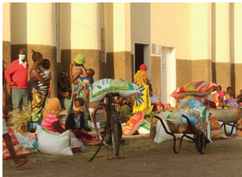
Top Priority in COVID-19 mitigation measures is the saving of lives. In picture, Distribution of Food Hampers at Francis Xavier Parish in Lusaka

In fact we find ourselves in a catch-22 situation that will take bold leadership to unravel. Why? Because of the mutually conflicting or dependent conditions. Should Zambia continue with a prolonged stay-at-home policy and suffer the collective consequences of a looming economic disaster? Or should Zambia open up economic activity with the risk of having to face a spike in COVID-19 cases, something that would almost inevitably stretch our health sector beyond its capacity and lead to a public health crisis?