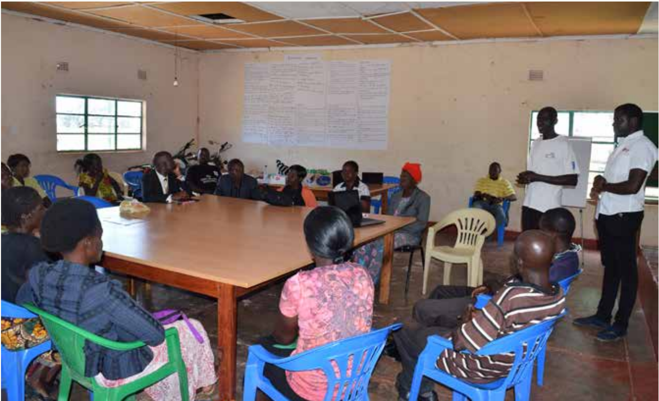
A focus Group Discussion (FGD) giving recommendations during the CCGA process