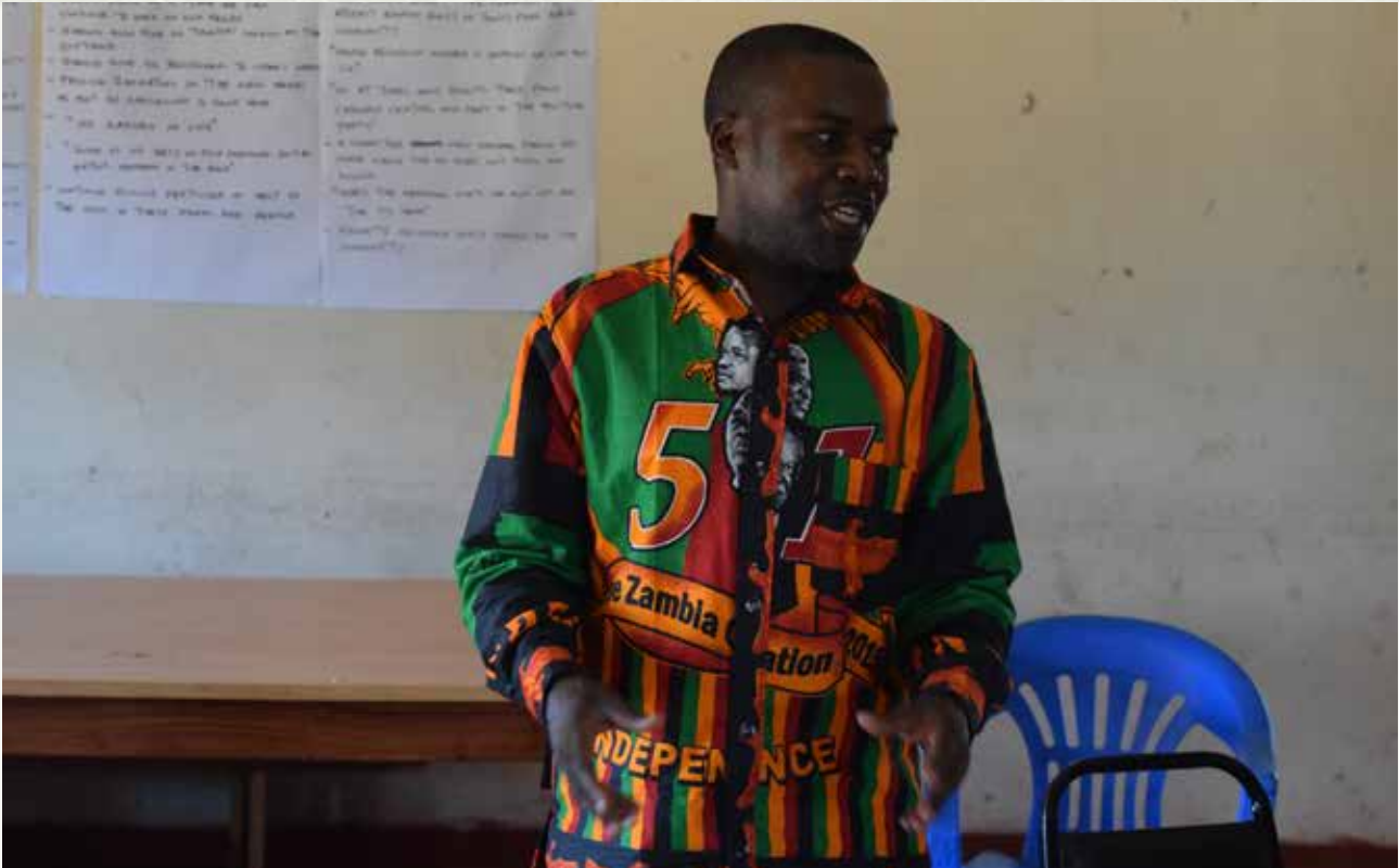
The Chavuma District Administrative Officer speaking during the validation process of the CCGA

District Administration towards the Jubilee Independence Day celebrations. Twelve (12) local people employed by Anglo America during the explorations were also cited to have benefitted.