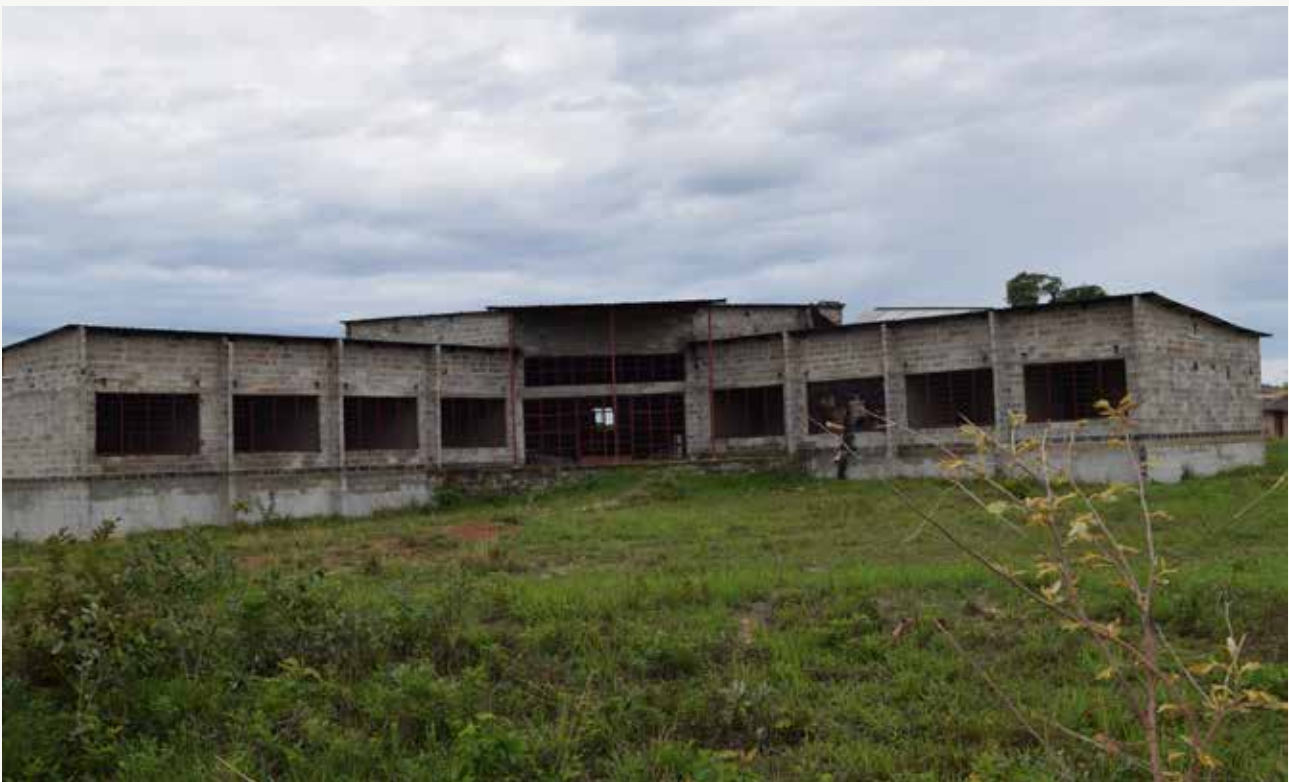
An incomplete police post constructed in the Kalombo community

A crucial barrier cited by the community was that the mining company had left holes in their cassava fields which were not covered for the safety of the communities'. Additionally, the community outlined several potential barriers that they felt would arise if active mining was to be done in their community. Residents further expressed concern that ignorance would be the biggest barrier because even though the mining company had gone into their community, they had no idea how to approach them. They went on to add that the little information they had was gotten through the rumors heard from different people in the district. The community members also identified political affiliation and perpetuation of regionalism, nepotism and tribalism by Government as barriers to community benefits from the government. Another possible barrier raised was that of employment of youths from other areas and districts which would invariably disadvantage indigenous youths from the Kalombo community.