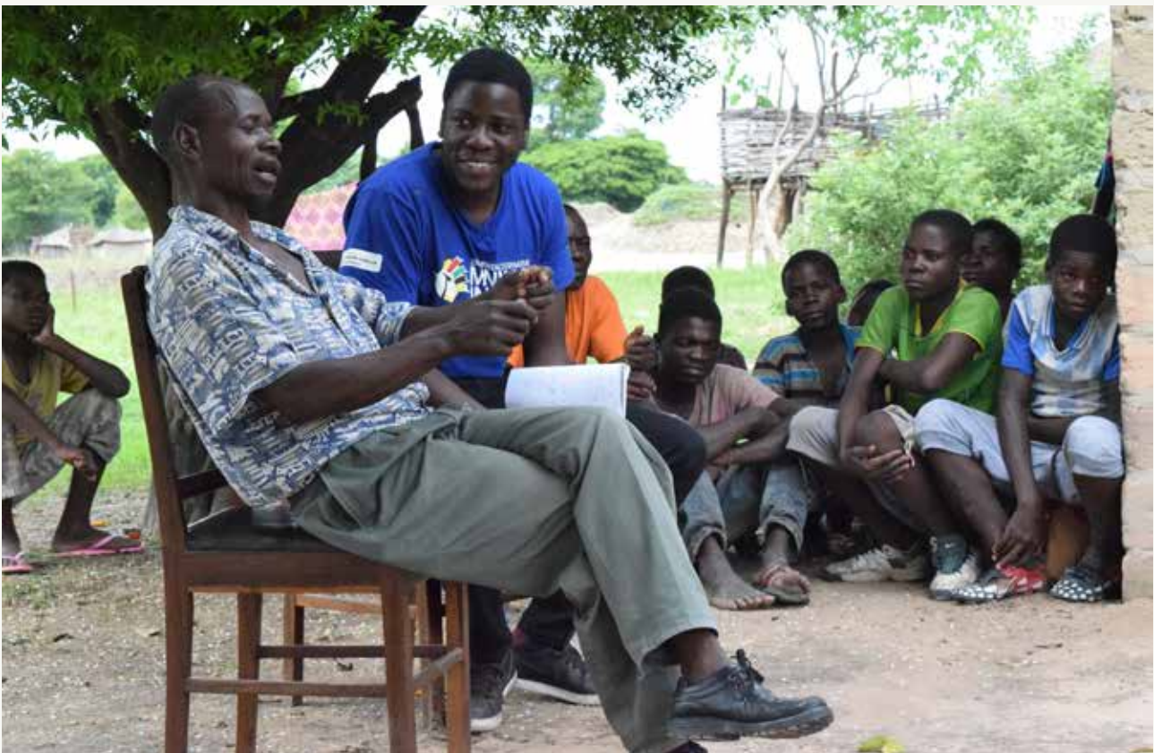
An elderly person in the Chinwandumba Community sharing his views with the researcher during the CCGA process