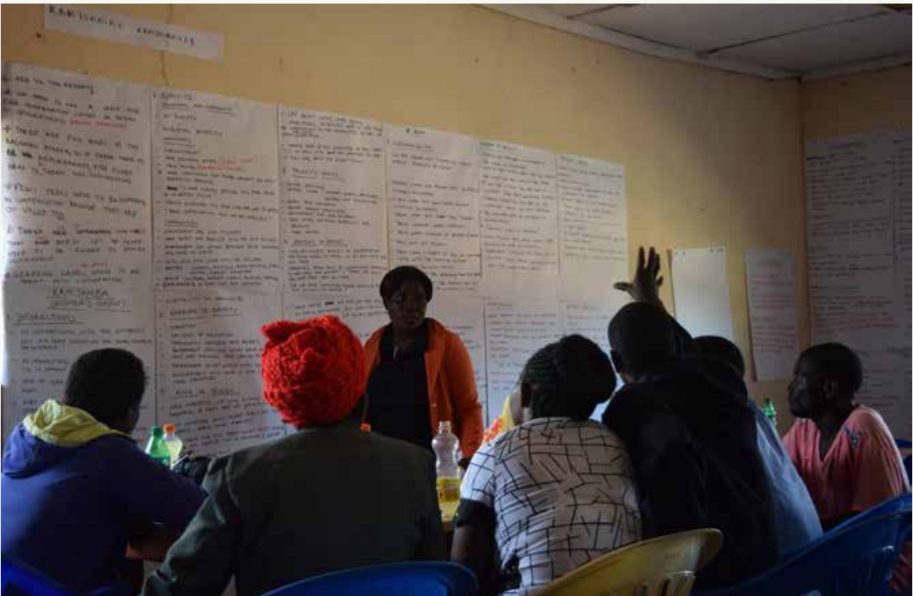
One of the women from Kamisamba taking lead during the validation process of the CCGA