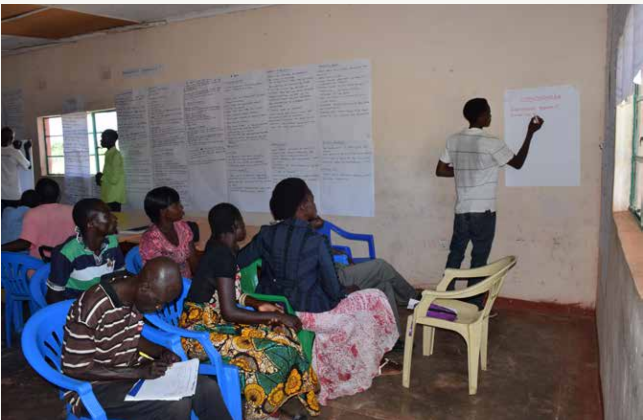
One of the youths facilitating a FGD during the validation process of the CCGA.