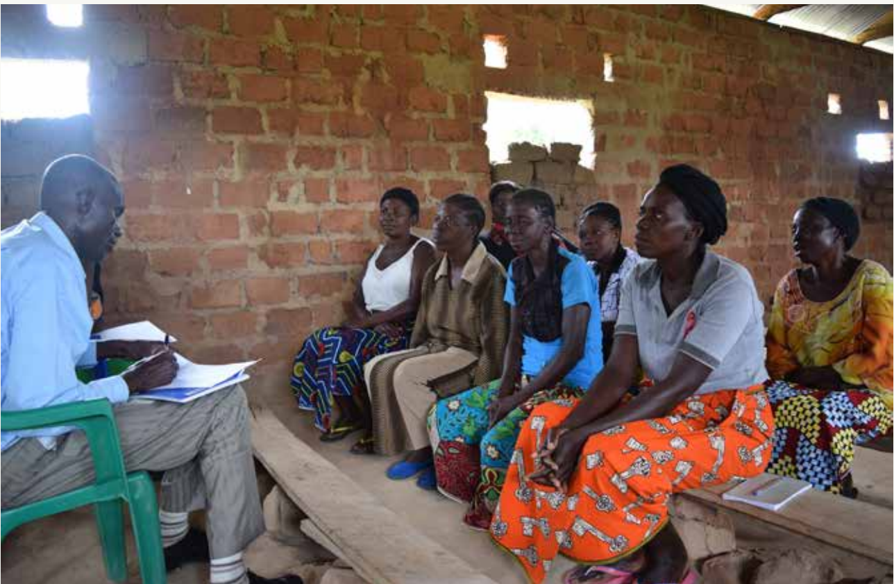
A group of women speak out about their experiences in the Kamisamba community

Residents of Kamisamba also contended that the government had not sensitized them over mining related issues and so they were unaware of where the mining company came from. "The only sensitization we receive comes from Non-Governmental Organisations"; community member.