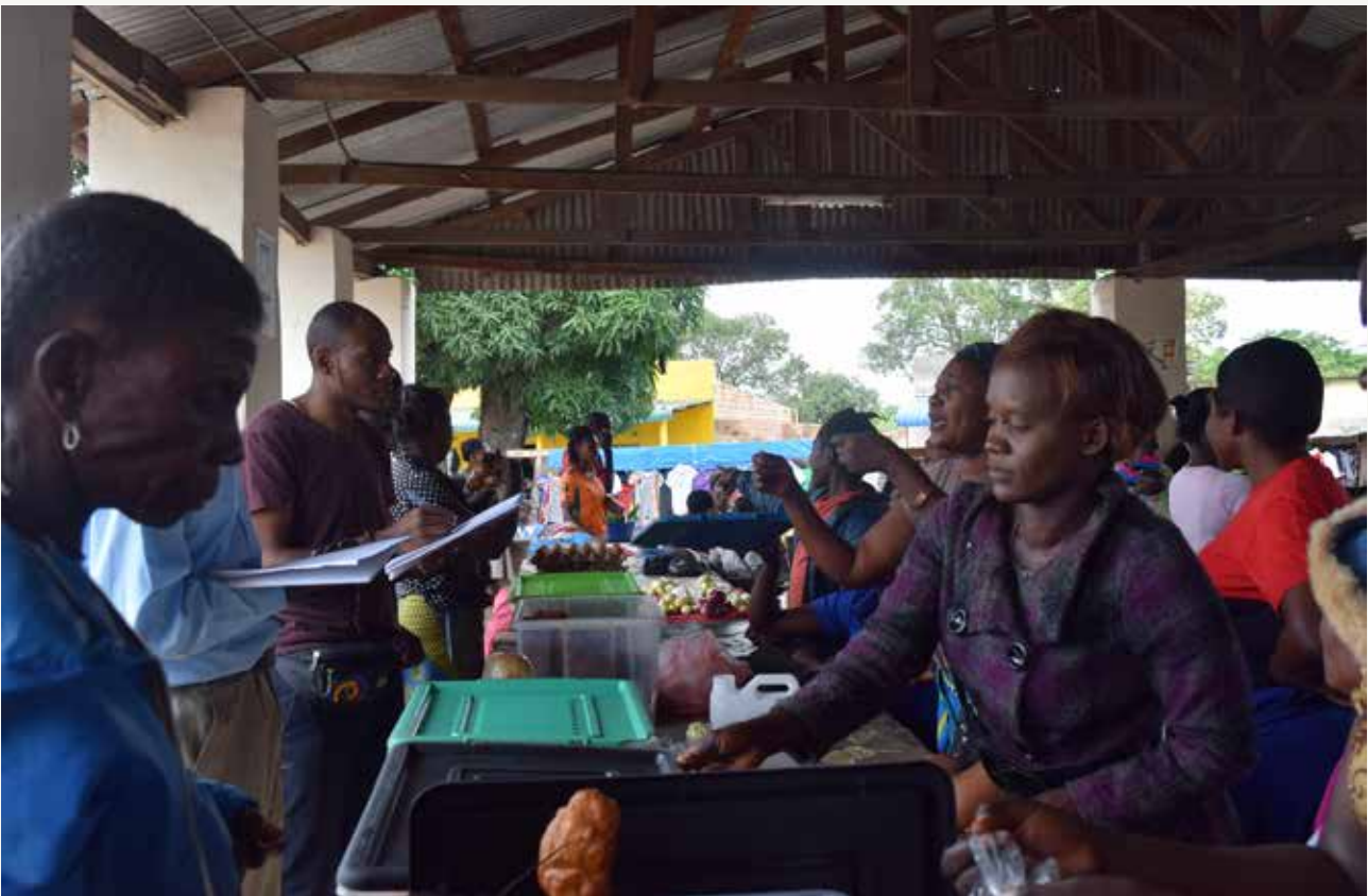
Traders in the Chavuma Central Market being interviewed during the CCGA process

The interviews conducted with community members in Chavuma Central revealed that although many of them had seen vehicles labelled Anglo-America driving through the town center in 2014, there had not been any direct interaction with the company. Residents of Chavuma Central further pointed out that most exploration did not take place in the main town center area. However, through interaction with other communities they were able to get certain information on the exploration activities the company was conducting and they were told that Anglo-America had come to conduct explorations and this would inevitably result into people living near prospecting sites being relocated because they would need to sell their houses. Some community members near the exploration sites also indicated that they had seen the company get samples of stone to test for mineral content, while others in the community said there was oil near the Zambezi river banks thus they suspected that people living near these areas would soon be displaced. The community further indicated that there was no formal introduction of the prospecting company with the community. Concerning their interaction with government, the community stated there was little interaction between the two parties.