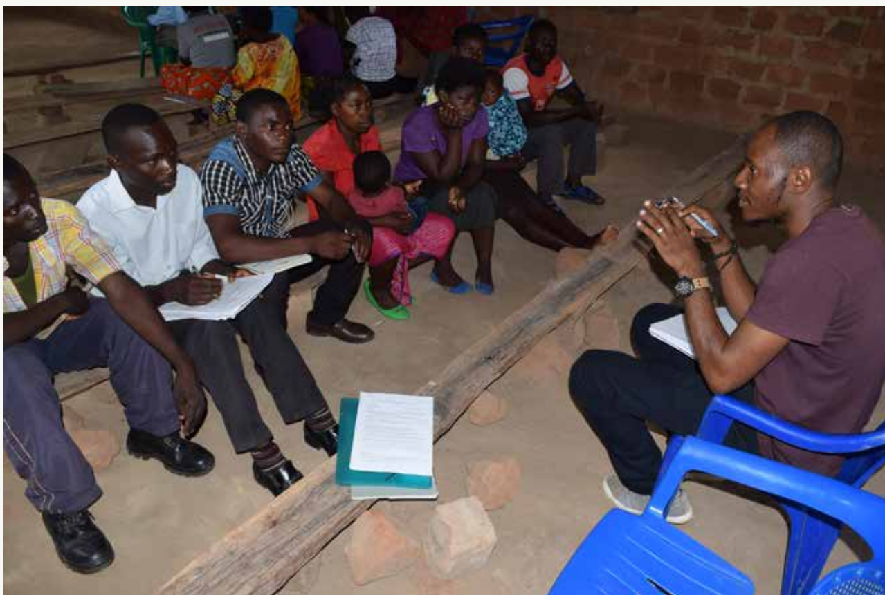
One of the researcher's explaining the CCGA process to a group of youths before the interviews