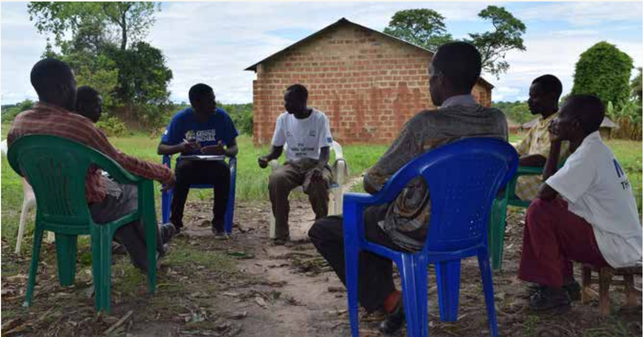
A Headman in the Kamisamba community responds to a question posed by the researcher

As regards interactions with government, community members stated that government officials had only been available to sensitize the community on non-mining related issues such as the upcoming Hydro- Electric Power project, the installation of boreholes as well as environmental related issues. This sensitization was done through the local council in partnership with Keepers Zambia Foundation (KZF) Zambia. The community also said they interacted with government when they formed youth clubs through the ministry of agriculture and community development.