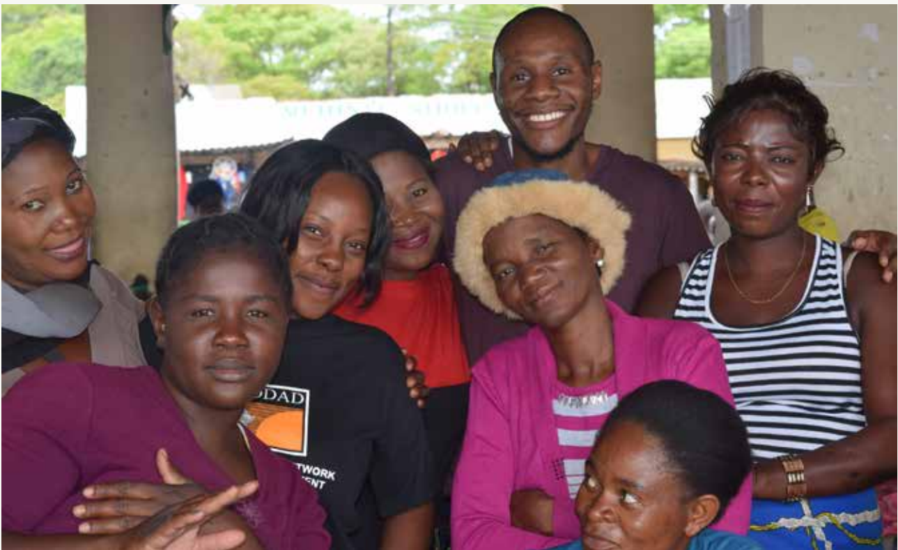
Part of the research team and traders in Chavuma Central Market during the CCGA process

“Corruption has been growing in Zambia from corner to corner even when it comes to looking jobs”. Community member