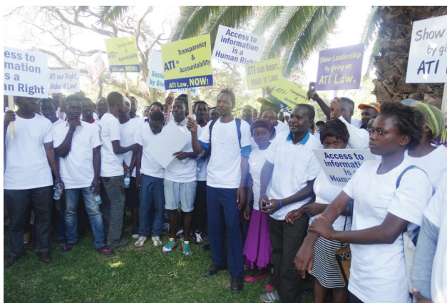
The ATI Coalition Picketing Parliament on the ATI Law in May 2016

Access to information (ATI) is the concept that information held by public or state institutions or private institutions conducting business that has implications for the public should be accessible to the public. It is also referred to as Freedom of Information (FOI) or the Right to Know (RTK). The basis for this accessibility is that all information kept in public institutions belongs to the public. Therefore, the public should be allowed to access such information.