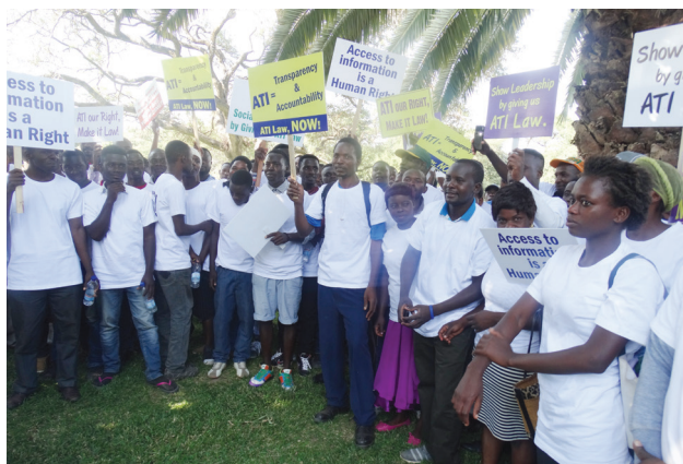
The ATI Coalition Picketing Parliament on the ATI Law in May 2016

Access to information (ATI) is the concept that information held by public or state institutions or private institutions conducting business that has implications for the public should be accessible to the public. It is also referred to as Freedom of Information (FOI) or the Right to Know (RTK). The basis for this accessibility is that all information kept in public institutions belongs to the public. Therefore, the public should be allowed to access such information.