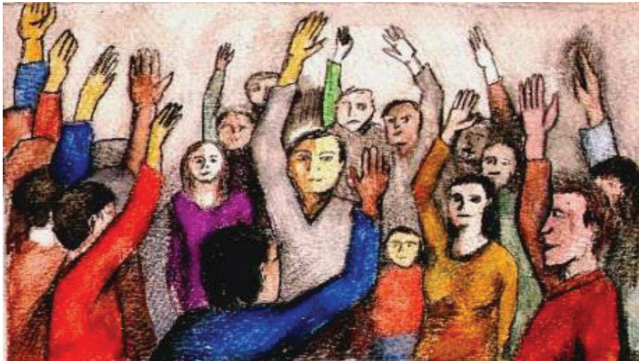
An Informed Community is a participative citizenry.

Access to information encourages effective participation by citizens in political, social and economic process. For example, when citizens are well informed about governance processes in their country and information is available on how they should participate in such processes, there is a possibility that they will take interest at least in some aspects of civic participation. But where information is lacking, effective public participation in important process cannot be guaranteed.