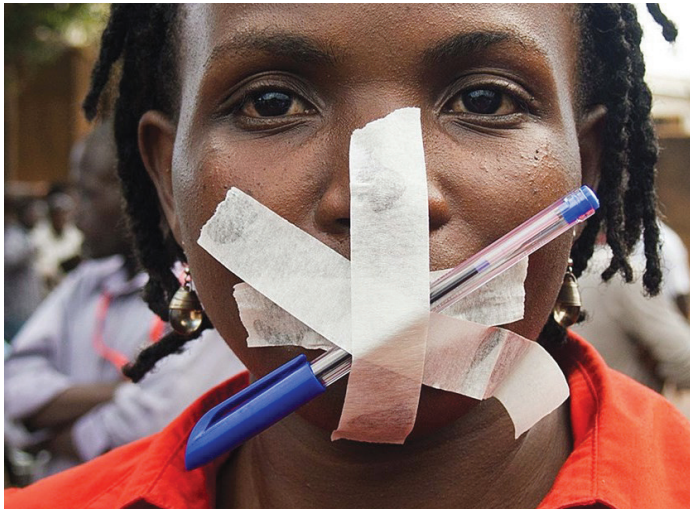
Media Legal Reforms have continued to be demanded by various stakeholders

Zambia has been working towards the enactment of the ATI law for almost two decades now. Attempts to do so have been made since the country reverted to multi-partism in 1991. At the time, journalists who felt that in the spirit of multi-partism it would be good also to enhance transparency by enacting such a law, spearheaded the demand for ATI. But the United National Independence Party (UNIP) government led by Kenneth Kaunda was uncomfortable with such a law. The Frederick Chiluba-led Movement for Multiparty Democracy (MMD) as an opposition party then capitalized on the demand and used it as one of their campaign promises. But after coming into power in historical elections, the new government began to equally drag their feet and later went quiet on the demand. In 2001, the government published the FOI bill for stakeholder input, but it was never enacted into law. Sensing that the government was not really interested in media legal reforms, the Zambia Independent Media Association (ZIMA), now called Media Institute of Southern Africa (MISA) Zambia Chapter, teamed up with other stakeholders and spearheaded the reforms. Stakeholders included the Press Association of Zambia, Zambia Union of Journalists, Zambia Association of Media Women, and the Society of Senior Zambia Journalists. This team of stakeholders implored various strategies of advocacy that put pressure on government and eventually made it succumb to their demands for their rights.