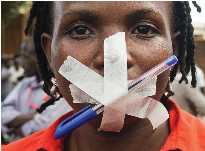
Media Legal Reforms have continued to be demanded by various stakeholders

Zambia has been working towards the enactment of the ATI law for almost two decades now. Attempts to do so have been made since the country reverted to multi-partism in 1991. At the time, journalists who felt that in the spirit of multi-partism it would be good also to enhance transparency by enacting such a law, spearheaded the demand for ATI. But the United National Independence Party (UNIP) government led by Kenneth Kaunda was uncomfortable with such a law. The Frederick Chiluba-led Movement for Multiparty Democracy (MMD) as an opposition party then capitalized on the demand and used it as one of their campaign promises. But after coming into power in historical elections, the new government began to equally drag their feet and later went quiet on the demand. In 2001, the government published the FOI bill for stakeholder input, but it was never enacted into law. Sensing that the government was not really interested in media legal reforms, the Zambia Independent Media Association (ZIMA), now called Media Institute of Southern Africa (MISA) Zambia Chapter, teamed up with other stakeholders and spearheaded the reforms. Stakeholders included the Press Association of Zambia, Zambia Union of Journalists, Zambia Association of Media Women, and the Society of Senior Zambia Journalists. This team of stakeholders implored various strategies of advocacy that put pressure on government and eventually made it succumb to their demands for their rights.