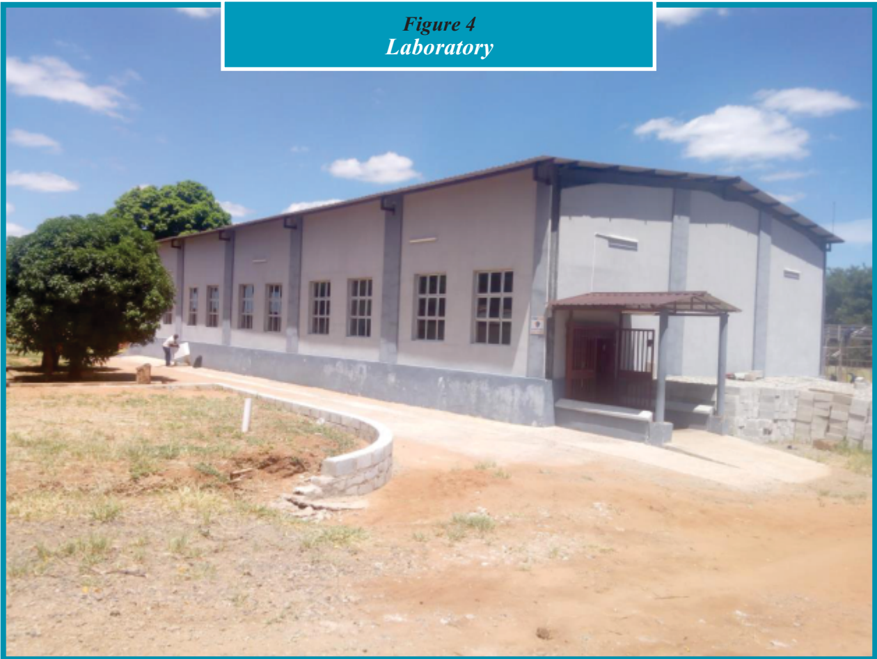
Figure 4 Laboratory

The key finding was that the project was completed by September 2017, according to schedule and specifications. Final touches remaining, that of painting and cleaning outside were found completed at the time of the social audit.