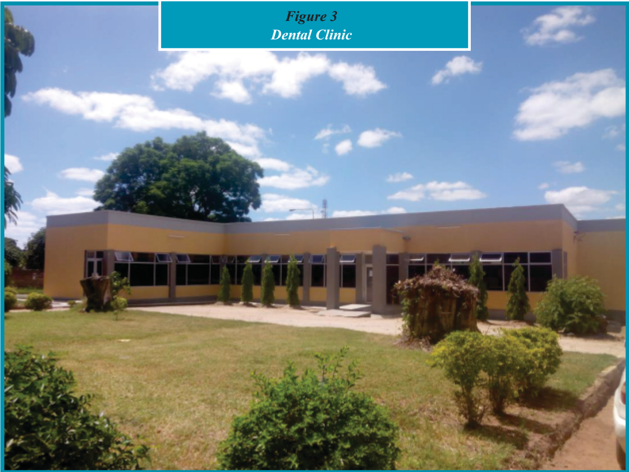
Figure 3 Dental Clinic

With new equipment in place the clinic was able to carry out the dental operations and referrals of patients to other hospitals like the University Teaching hospital (UTH) in Lusaka had reduced. And the facility had highly trained and dedicated team of dentists.