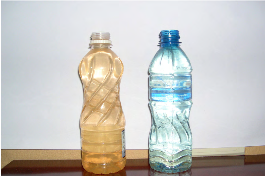
Water from one of the boreholes in Kalumbila in North-Western Province