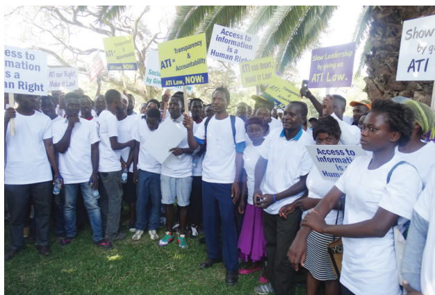
The ATI Coalition Picketing Parliament on the ATI Law in May 2016

Access to information (ATI) is the concept that information held by public or state institutions or private institutions conducting business that has implications for the public should be accessible to the public. It is also referred to as Freedom of Information (FOI) or the Right to Know (RTK). The basis for this accessibility is that all information kept in public institutions belongs to the public. Therefore, the public should be allowed to access such information.